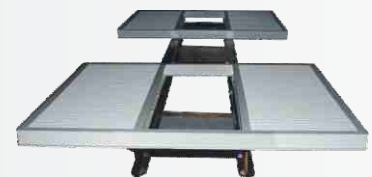
Tyre Rest Platform (Optional)